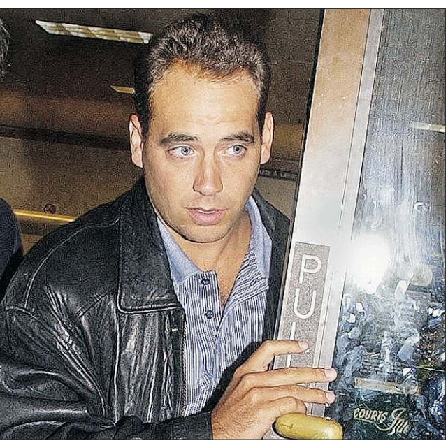
EU ES